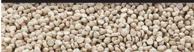
Super S (Granule)